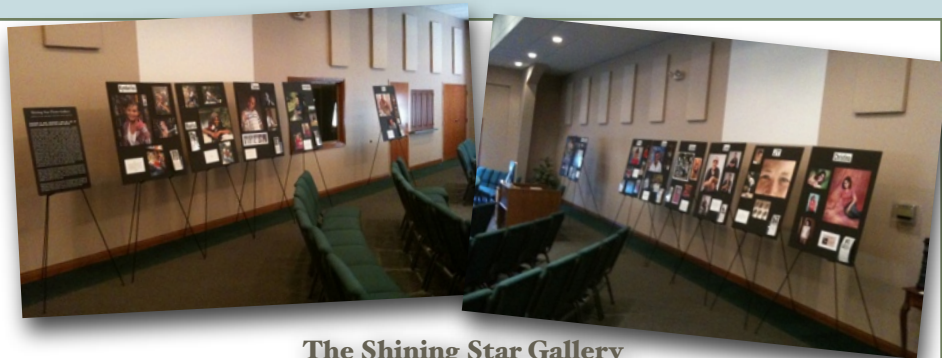
The Shining Star Gallery